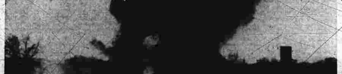
Fire which destroyed the Old River Mills building in a busy section of the Greenville, S. C., industrial area kept firemen and all available equipment busy for hours, and did heavy damage. Shown at its height, the fire was kept away from other plants in the neighborhood.

Milwaukee, April 2.—(AP)—The strike-bound Allis-Chalmers Manufacturing Co. scene of riotous outbreaks in which 48 persons were injured, suspended production today at the request of state and local authorities seeking to prevent recurrence of disorder and bloodshed; closing Comes After Three-Hour Battle with Strikers.